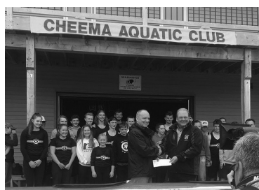
(taken pre covid)