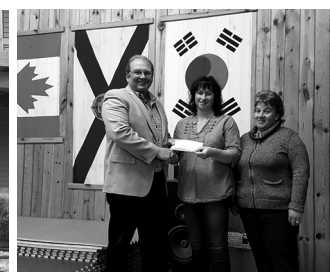
(taken pre covid)